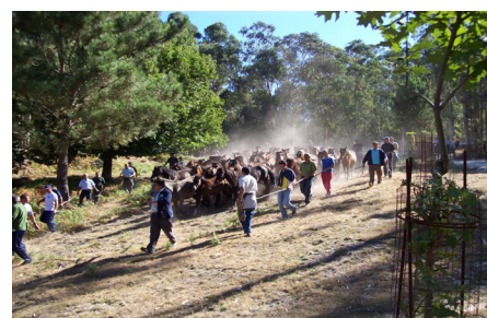
Figure 2. Every year during the summer, some days, the villagers go up the mountains in search of the horses, which lead to a stone enclosure where animals are captured to mark them and cut their manes.